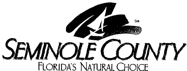
EXHIBIT " B"